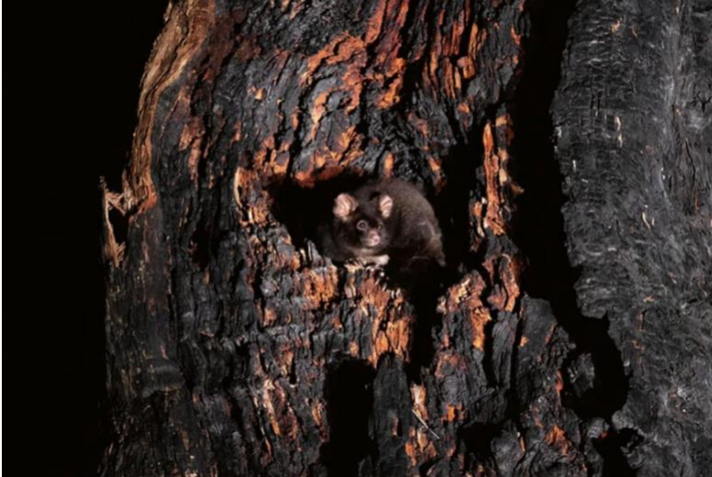
An endangered greater glider.

In addition to signing the letter to your state MP to close logging loopholes (see 3. above), Kinglake Friends of the Forest are urging people to send in a submission to the state Inquiry into Victoria's 2026 Summer Fires , due on 19 April 2026.